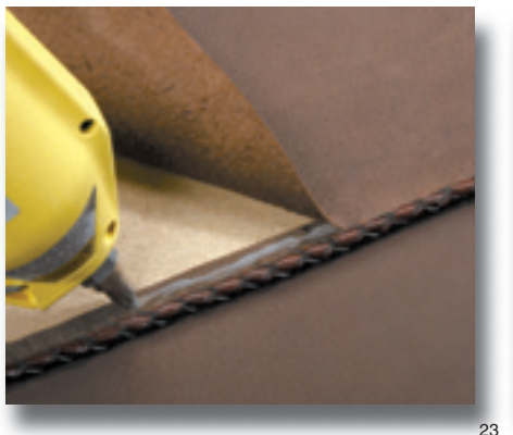
For furniture and upholstery, PUR 250 adhesive bonds leather or fabric gimping and seams.