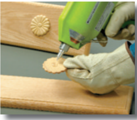
Bond wood or plastic rosettes to wood drawers without fixturing or drying time.