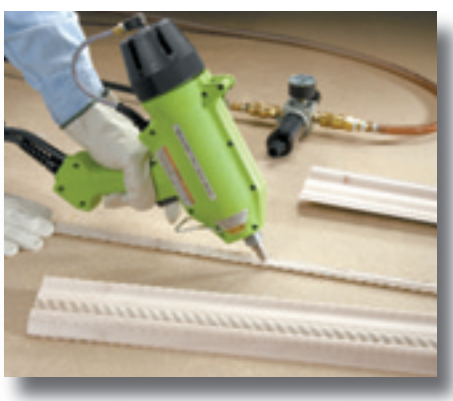
For both PUR Easy and PUR Easy 250, an optional filter/pressure regulator is available to remove particulate material and water.