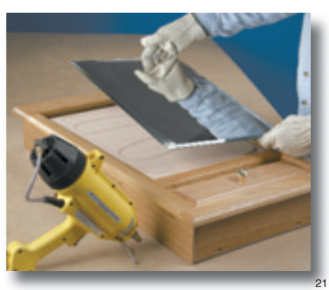
Long open time provides production speed flexibility for bonding a mirror to plywood or MDF panel in a medicine cabinet door.