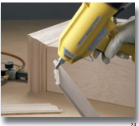
With a thin bond line, PUR 250 adhesive makes a secure, aesthetically-pleasing crown molding assembly.