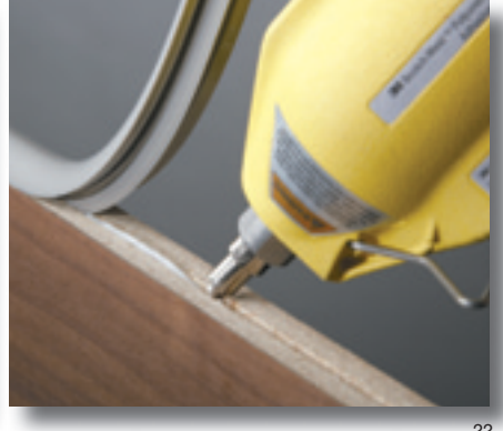
A neatly applied bead of adhesive bonds the extruded plastic edge molding to the particle board core of a counter top.