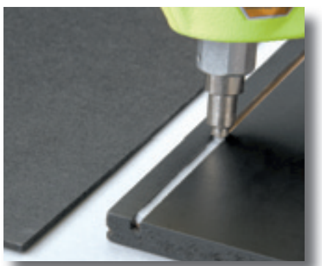
Permanently and quickly bond wood and MDF (Medium Density Fiberboard) bottoms and side panels in drawers.