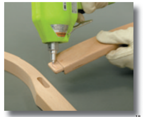
Adhesives are available for bonding a variety of wood sizes and configurations such as this mortise and tenon assembly.